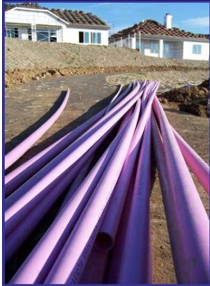
▲ Construction ready to begin