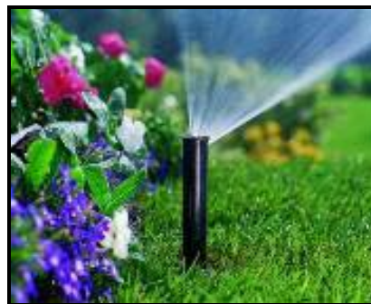
▲ Recycled water irrigation

Recycled water comes from wastewater collected from the El Dorado Hills area that is treated, filtered, and disinfected. This level of treatment is called tertiary , and it meets state requirements for irrigation. The water is delivered to your home in a completely separate system of purple pipes.