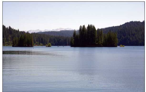
Jenkinson Lake at Sly Park Recreation Area in Pollock Pines

For more information from the U.S. EPA, contact the Safe Drinking Water Hotline: 1-800-426-4791.